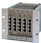
Example of basic unit I

The IDT 32 is a modern high end control panel with wide-ranging application in the areas of alarm monitoring, fire detection and video surveillance. Through its modular construction, the best, bespoke, Plug-&-Play customer solutions can be created, using the up to 21-slot units.