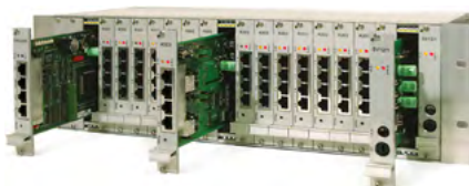
Example of 19" version, fully populated, basic unit II