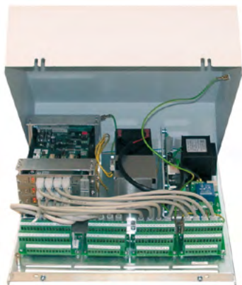
Basic unit III, with wall-mounting housing, fully populated